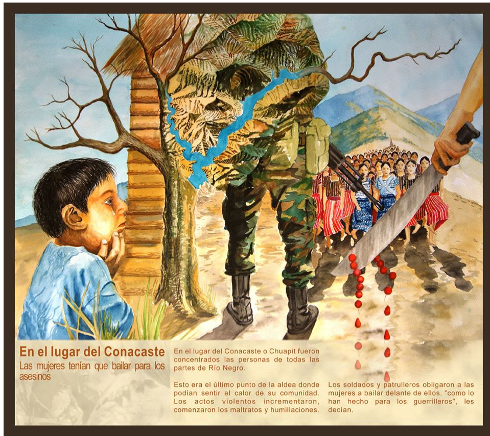
Depiction of Chixoy Dam/Rio Negro massacres