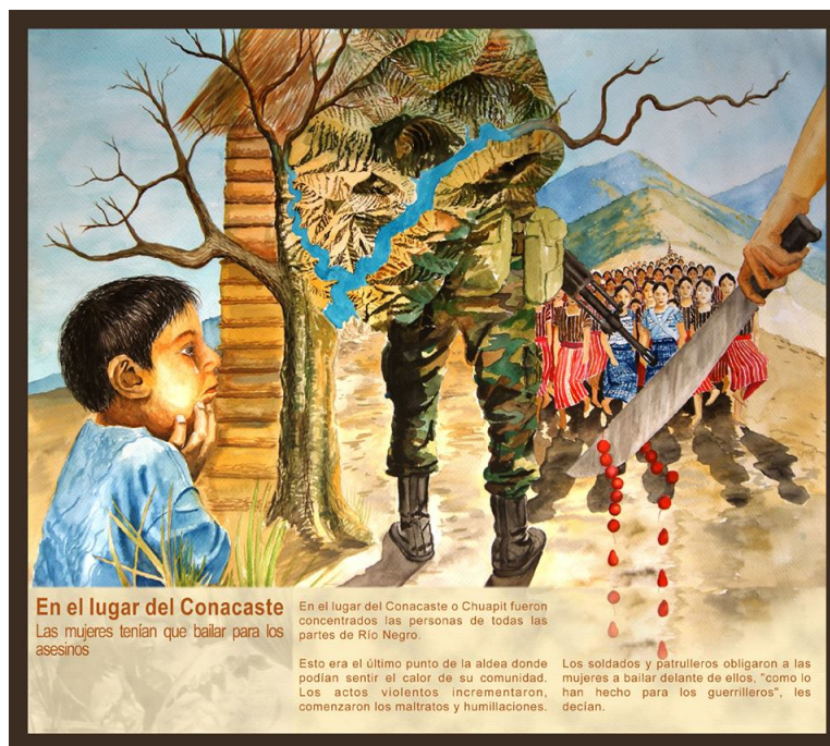
Depiction of Chixoy Dam/Rio Negro massacres, used in popular education work

The bill is named in memory of Maya Achi people in Guatemala who were tortured and raped, murdered and massacred, and the survivors forcibly displaced between 1975 and 1985, so as to make way for the construction of the Chixoy hydro-electric dam, an investment project financed and constructed by the World Bank and Inter-American Development Bank (IDB) in partnership with the U.S.-backed genocidal regimes of Generals Lucas Garcia and Rios Montt.