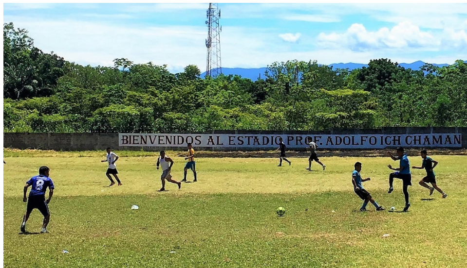
Community soccer game on Professor Adolfo Ich field (photo 2018).