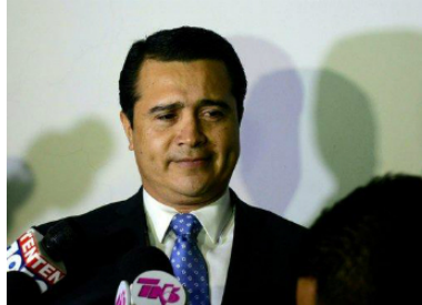
Former Honduran congressman Juan Antonio "Tony" Hernández