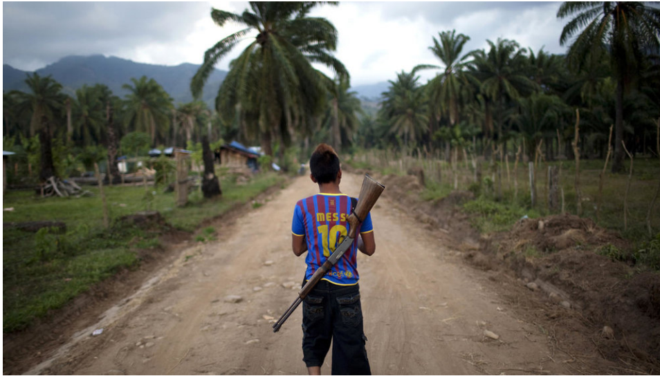
Photo: HONDURAN YOUTH PATROLS THE CONFLICT ZONE BETWEEN CAMPESINOS AND DINANT

One of Dinant Corporation's most profitable businesses are the twelve thousand hectares of African palm plantations it owns in the Aguan and Lean Valleys that feed two extraction plants and an palm oil refinery in the city of Tocoa. Palm oil is a valuable input used in different industries, like food and cosmetics, around the world.