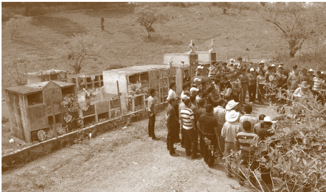
Azacualpa community members gather for a spiritual ceremony by their 200 year old cemetery, in western Honduras, that Toronto-based Aura Minerals wants to destroy so they can expand their open-pit, cyanide leaching gold mine. Photo: Rights Action, April 2016