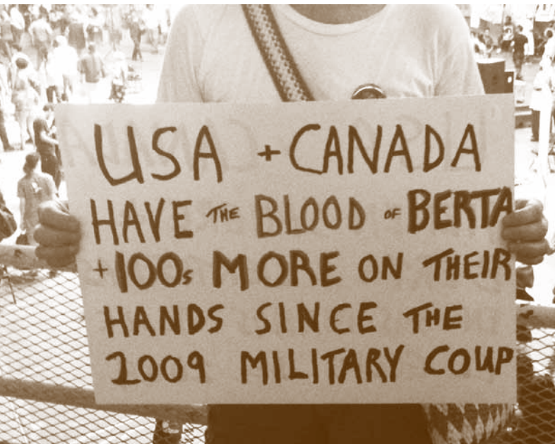
“Berta Caceres Lives” Gathering, Honduras, April 15, 2016

It has been a sad and hard spring and summer since the March 2 nd assassination of Berta Caceres.