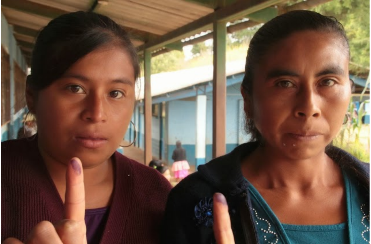
Participants in the community consultation show off their inked fingers, a sign of their vote.