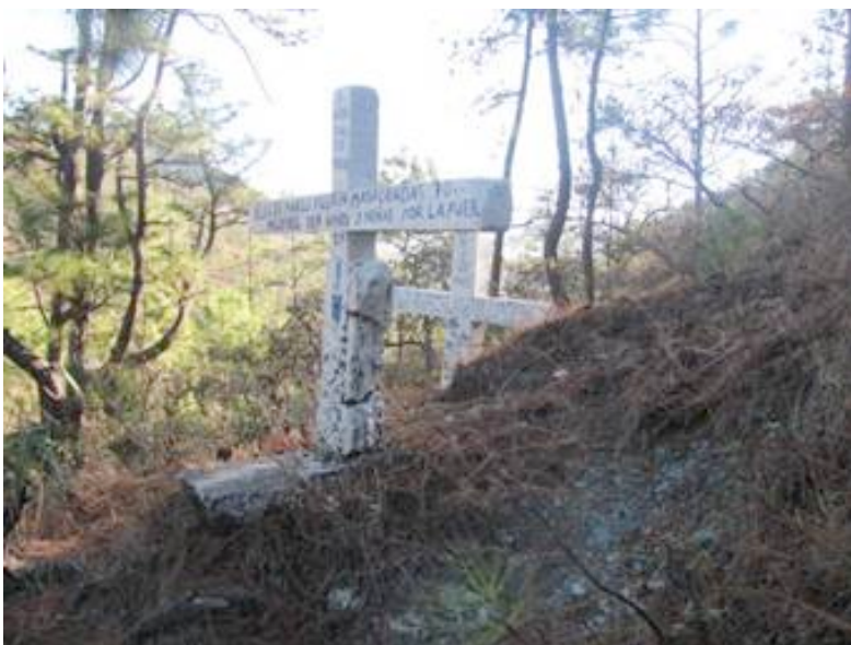
(Site of the March 13, 1982 massacre of 177 women and children from the Mayan Achi village of Rio Negro.)

This massacre was one of 4 programmed massacres planned and carried out in 1982 by the Guatemalan military, so as to forcibly “evict” [exterminate] the villagers of Rio Negro, so as to make way for the Chixoy dam hydro-electric dam, a “mega-development” project of the World Bank (WB) and the IDB (Inter-American Development Bank).